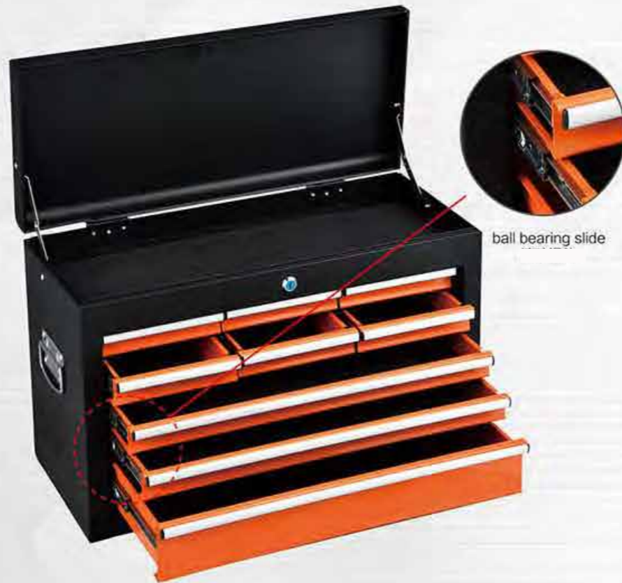
ball bearing slide