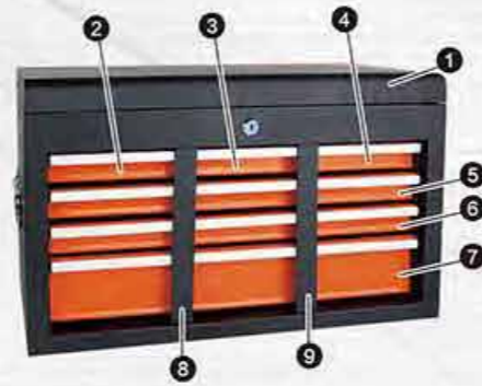
GE - 2005 Toolbox