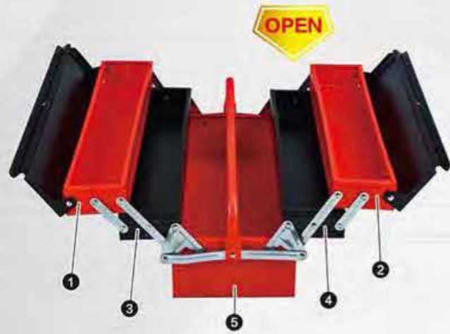
GE - 09B Toolbox