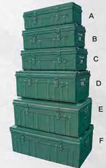
GE - 208 Toolbox