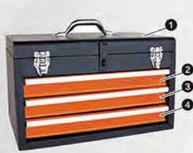
GE - 2003 Toolbox