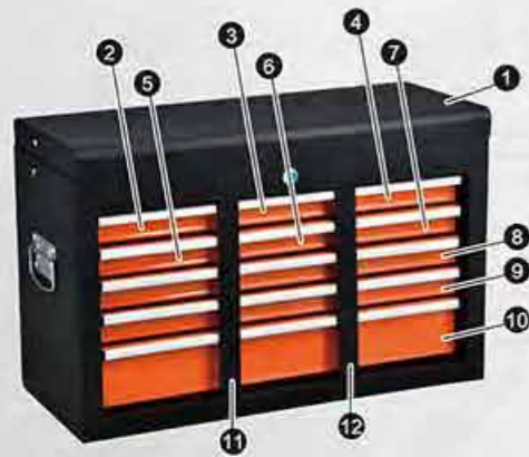
GE - 2006 Toolbox