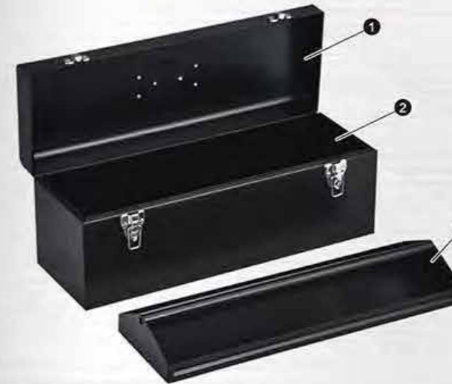
GE - 13 Toolbox