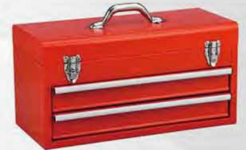
GE - 12C Toolbox