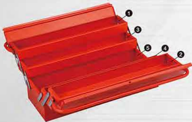
GE - 209 Toolbox