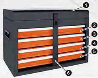
GE - 2004 Toolbox