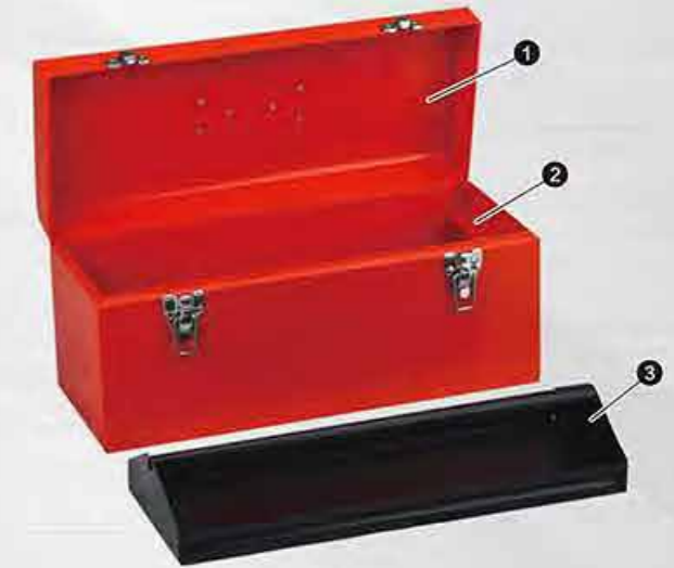
GE - 13B Toolbox