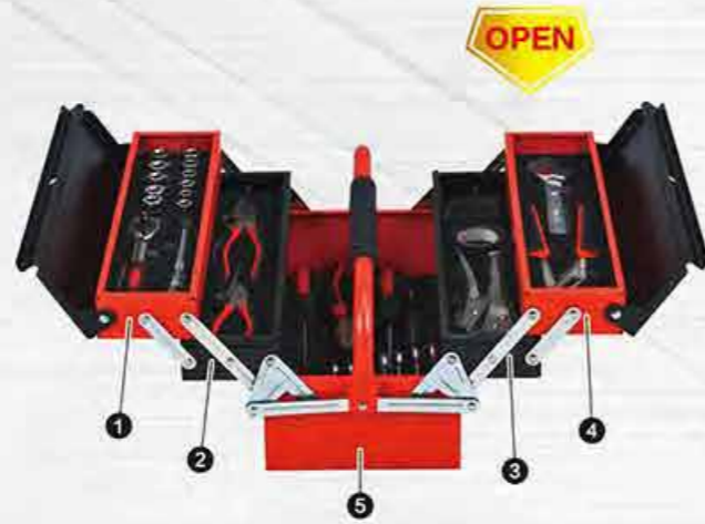
GE - 09C Toolbox