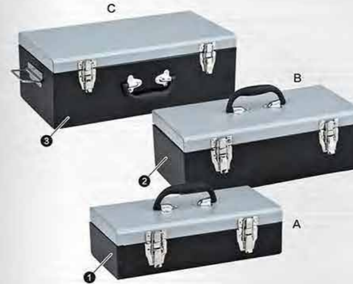
GE - 10ABC Toolbox